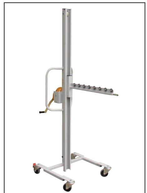
Manual Roll Prong Trolley