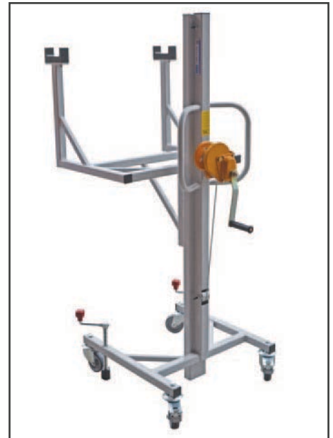
Lift Trolley with Customised Arms