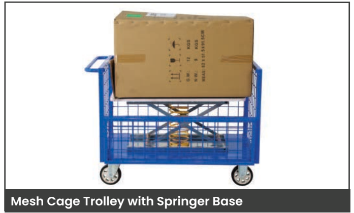
Mesh Cage Trolley with Springer Base