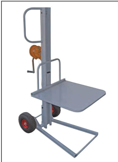
Heavy Duty Manual Wind Trolley