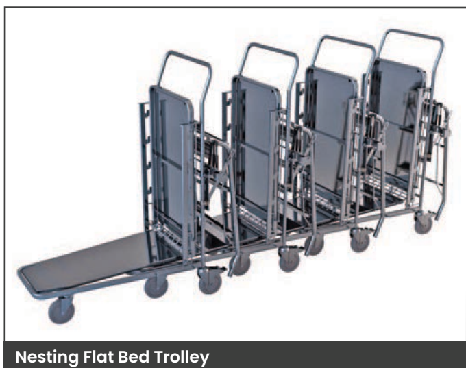
Nesting Flat Bed Trolley

MHA offer customers a wide range of custom trolleys to suit their particular manual handling problems and workplace needs. This means that if any of our existing range doesn't quite meet your specific requirements, we can tweak one, or combine styles to create a completely different and innovative trolley. These are some examples of our customised trolleys.