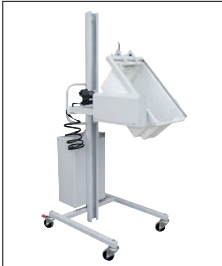
Tote Bin Lifter & Tipper