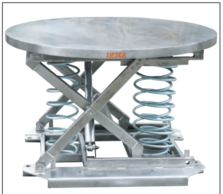
Stainless Steel Version (M5012)