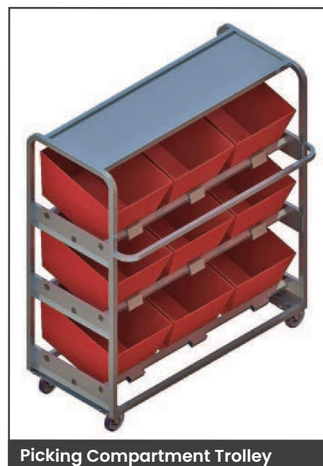
Picking Compartment Trolley