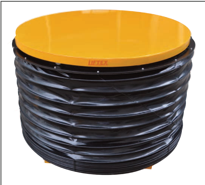
Solid round top with side protection curtain (M5099)

Perfect for warehouses, workshops, and manufacturing facilities, these tables enhance productivity and streamline operations. Say goodbye to manual pallet turning hassles and embrace the innovation of MHA's Custom Spring Loaded Rotating Pallet Tables, for an easier and more accessible workflow.