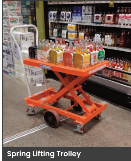
Spring Lifting Trolley