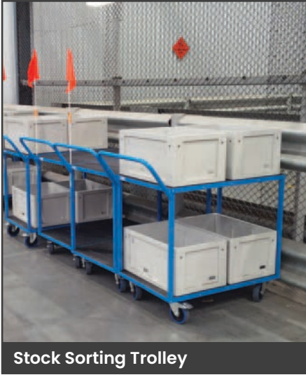
Stock Sorting Trolley