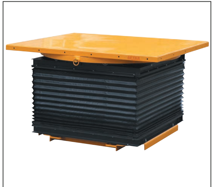
Square top with side protection curtain (M5097)