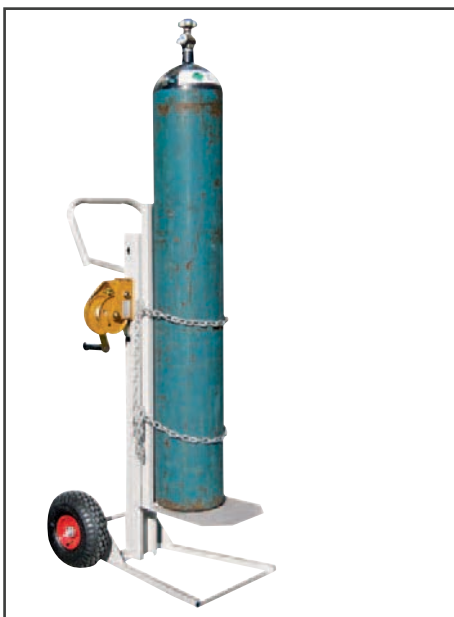
Gas Bottle Lifter