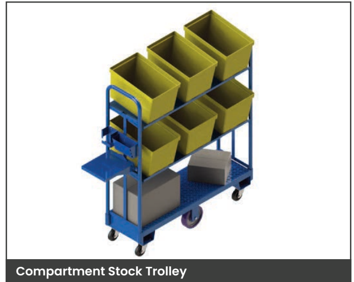
Compartment Stock Trolley