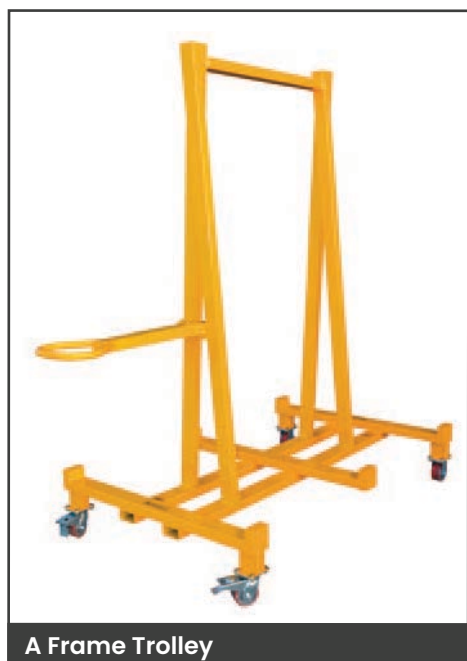
A Frame Trolley