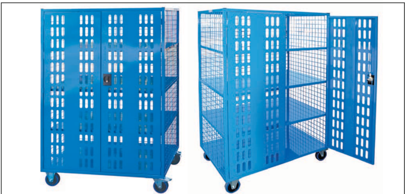
Blue Heavy Duty Cage Trolley