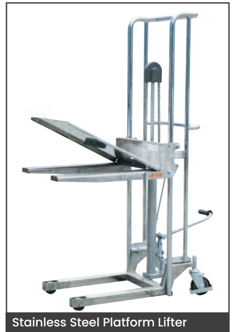
Stainless Steel Platform Lifter