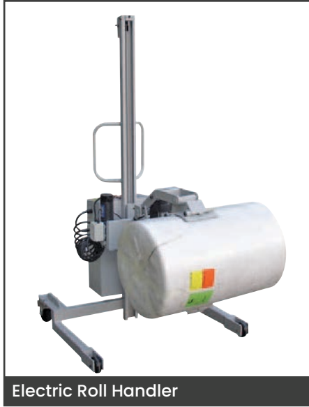
Electric Roll Handler