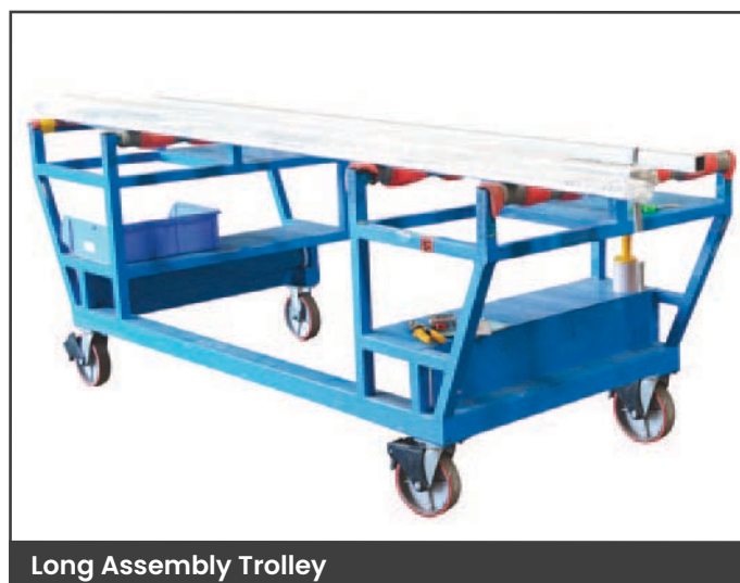
Long Assembly Trolley