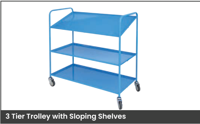
3 Tier Trolley with Sloping Shelves