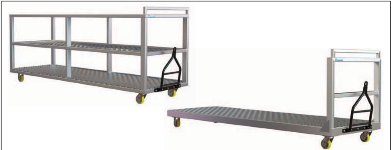
Fully Welded Aluminium Trolleys