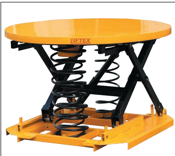
Solid top version (M5010)