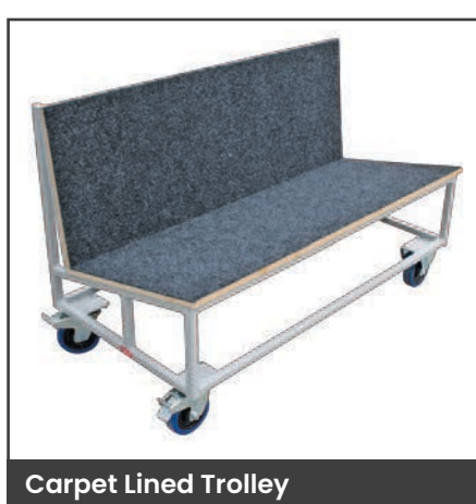
Carpet Lined Trolley