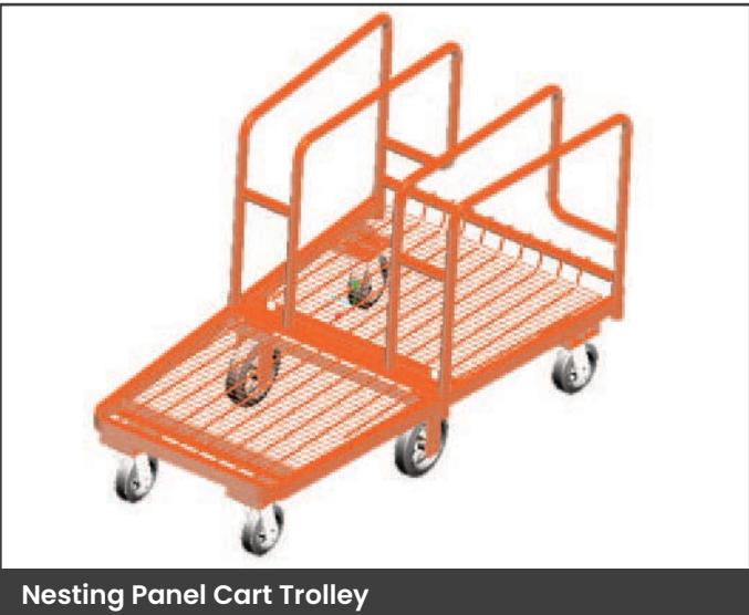
Nesting Panel Cart Trolley