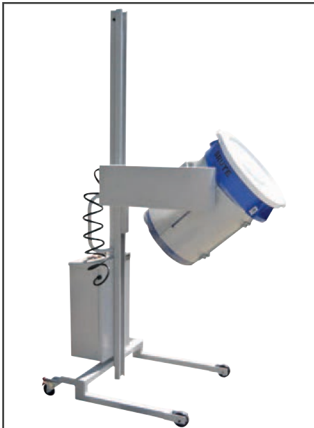
Electric Bin Tipper