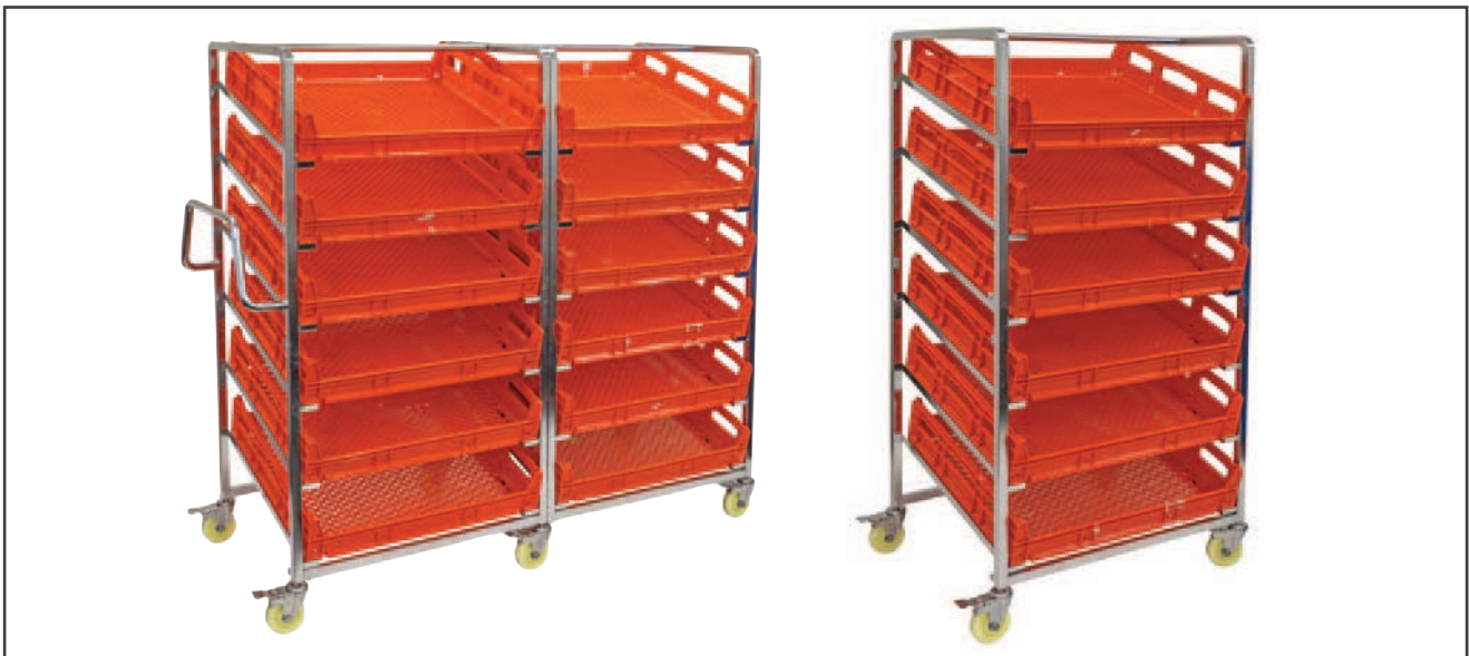
Bread Crate Trolleys