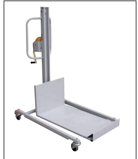
Manual Extra Long Platform Lifter