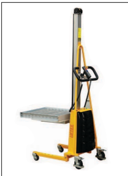
Work Positioner with conveyor platform