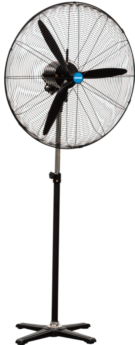
Height fully extended