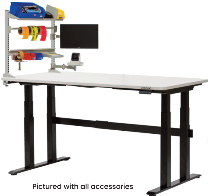
Pictured with all accessories